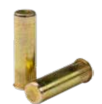
CAK Closed End Series

FULL PRODUCT LINE IN STOCK | BROKEN BOX QUANTITIES