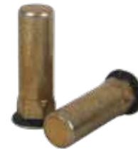
CAH Closed End Series