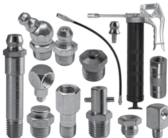
GREASE FITTINGS & ACCESSORIES