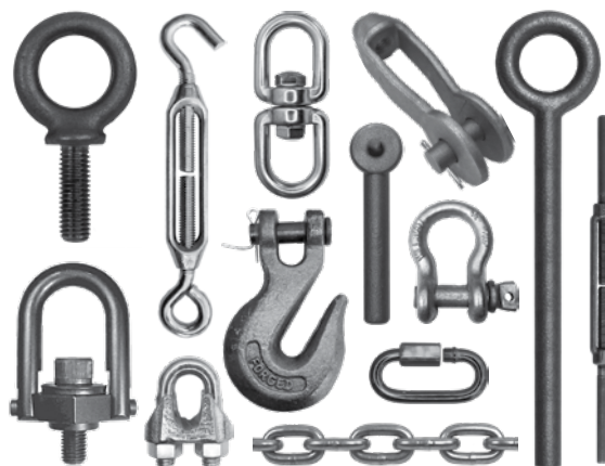
PREMIUM LIFTING HARDWARE