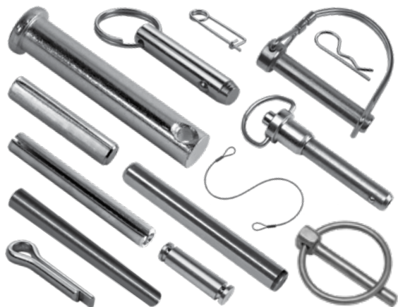
PINS & WIREFORMS

LOW MINIMUMS ■ GREAT PRICES ■ EASY ORDERING